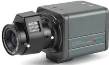
Optional for CS Mount Lens